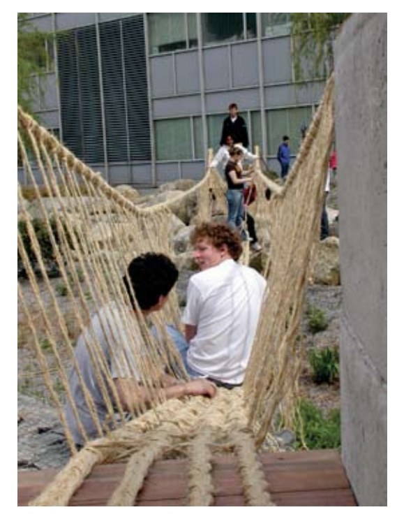
Figure 4. Students installing the Chaka Stata. Estudiantes instalando el Chaka Stata.

to be explored and Twantinsuyu as the cultural and political entity within which that exploration would be developed. We were at a loss, though, to define an appropriate student laboratory project, especially in light of the great success that continued to surround the giant khipu of 2006.