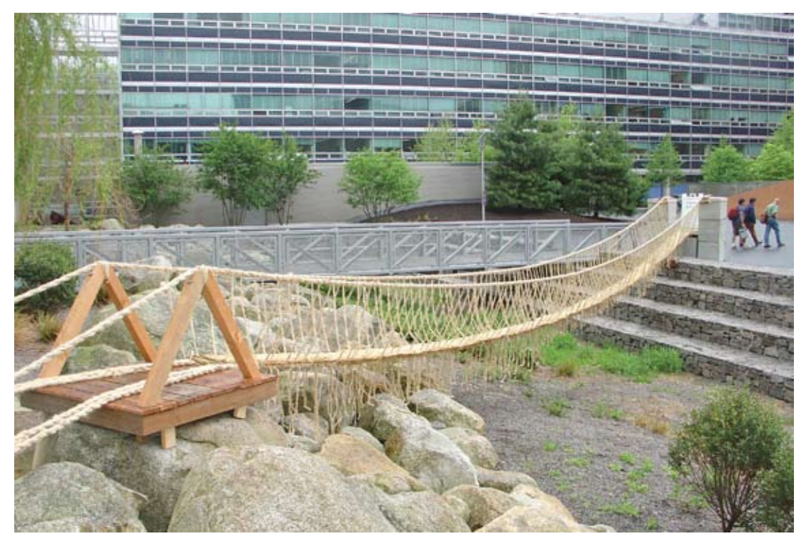
Figure 3. Chaka Stata.

One morning in the early spring of 2007, the faculty scheduled to teach Materials in Human Experience met, over coffee, to decide upon the case studies and laboratory projects for the class. Once again we selected fibers as an engineering material